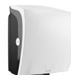
82094 Katrin Plastic Dispenser For System Paper Towel Roll, White