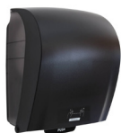
40711 Katrin Plastic Dispenser Extra Large For System Paper Towel Roll, Black

Selection from all countries. Please refer to web page for market-specific availability.