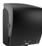
82070 Katrin Plastic Dispenser For System Paper Towel Roll, Black