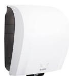
40735 Katrin Plastic Dispenser Extra Large For System Paper Towel Roll, White